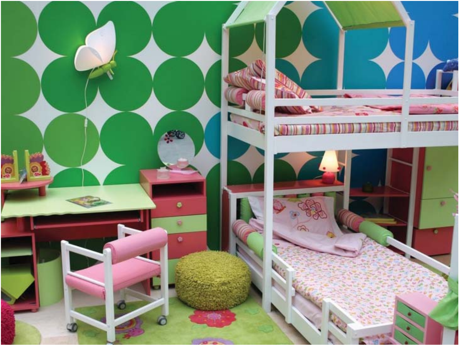
From bed coverings, wall paints, furniture and floor patterns